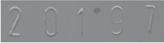
Al scanner function example: test object surface picture (digital photo)