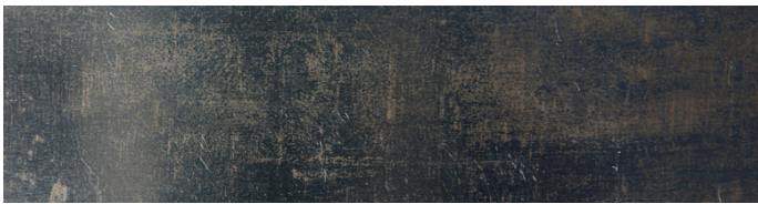
Fe scanner function example: test object surface picture (digital photo)