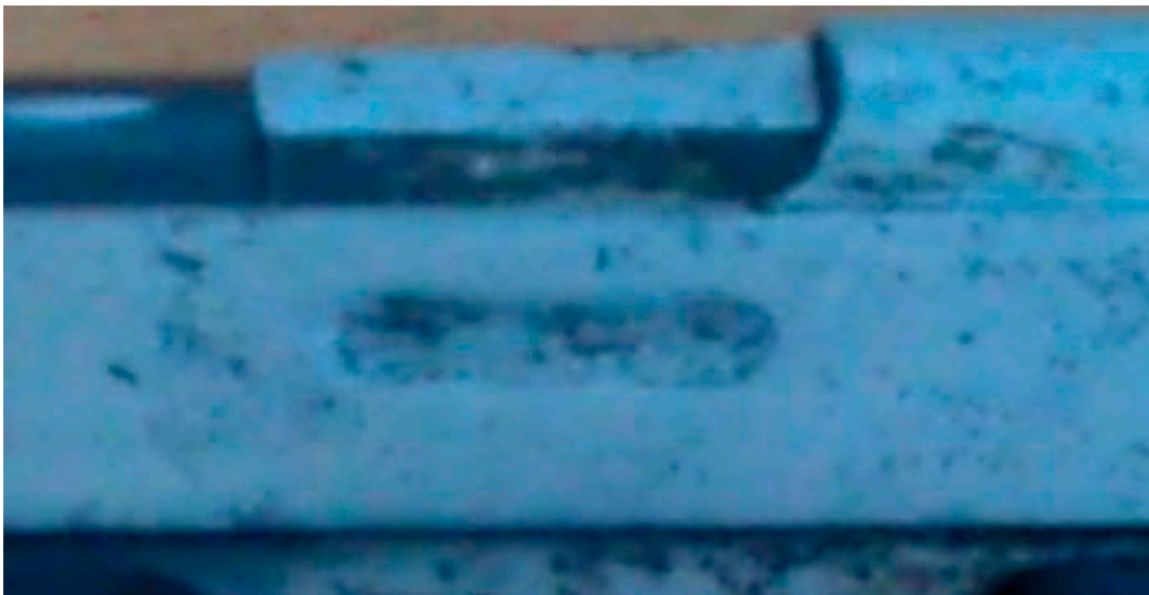
Object photo — the MCM pistol with the removed number