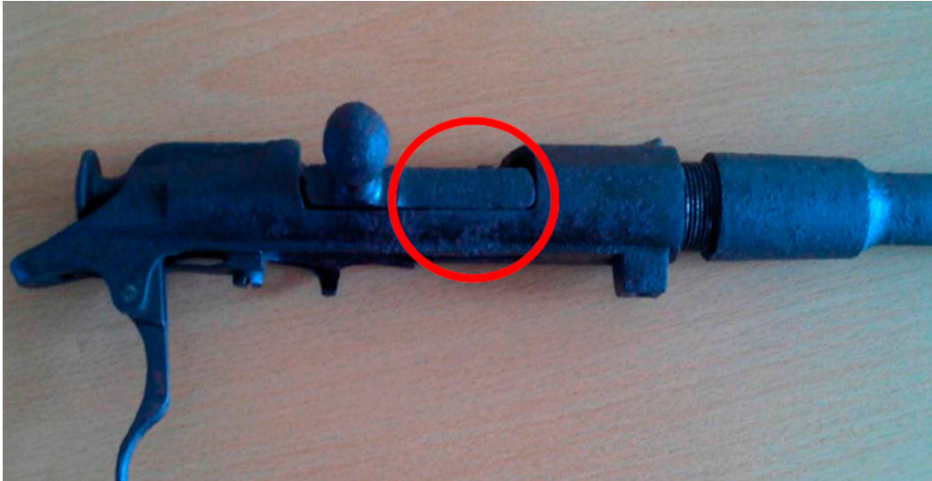
Object photo — the Mosin rifle with corroded marking