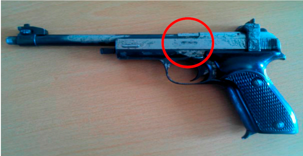
Object photo — the Mosin rifle with corroded marking