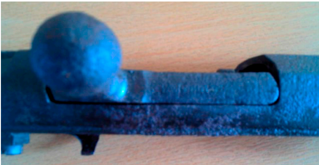
Photo of the number platform — elements of the number are not recognized